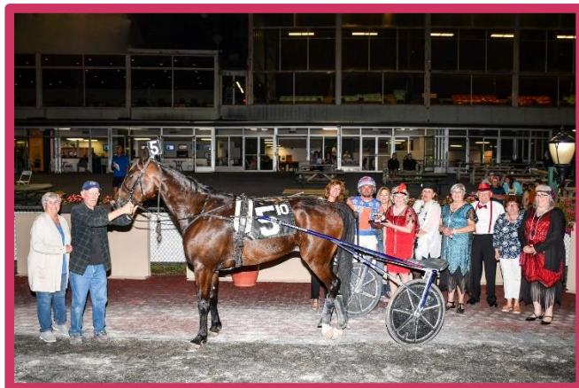
In the winner's circle awarding the trophy to the winner of the Zonta-sponsored race.